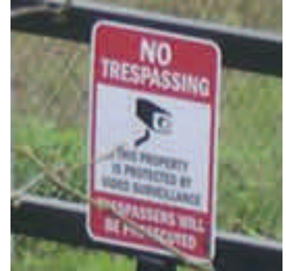
THIS HAS GONE TOO FAR!