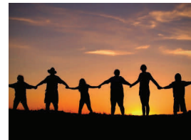
If you want to go fast, go alone. If you want to go far go with others.

helps to gain momentum and assure sustainability.