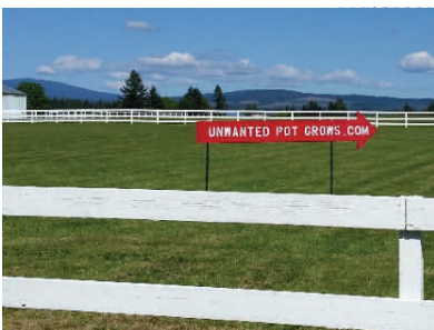
Neighbors put up unwantedpotgrows.com sign opposing this industrial complex.